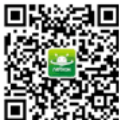
Netvox Smart Butler