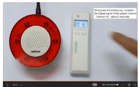
Short Press "Binding Key"