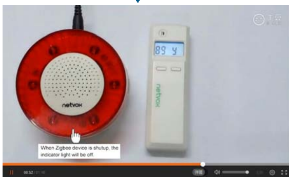
LED of the ZB Device Goes Out when it's not in Working Mode