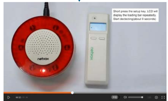
Short Press "Setup Key"