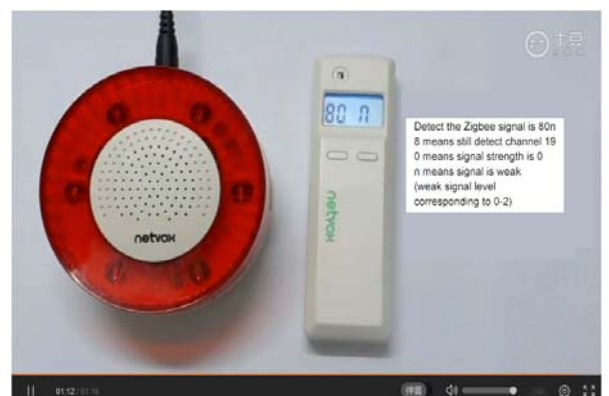
LCD Indicates the Signal Strength of the chosen RF Channel