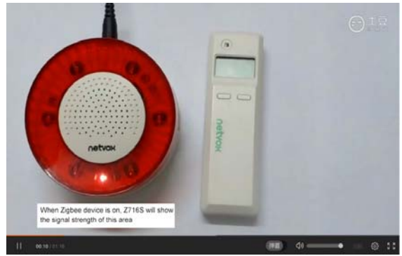
Detect Signal Strength of the Coverage