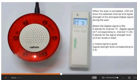
LCD shows the Strongest RE Channel and Signal Strength